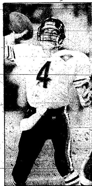
STEVE WALSH: The Chicago Bears quarterback completed 15 of 23 passes for 221 yards and two touchdowns.

He offset his two touchdown passes with two interceptions, and was replaced by Sean Salisbury in the final minutes. Despite his outstanding 11-year NFL career, Moon's record remains tainted by his "playoff" failures as does Green's Minnesota tenure. "It's frustrating this year, because it's right here and right now," said Moon, 3-6 in the playoffs during his 10 seasons in Houston. "This is a game we felt we should have won. There's no question we're all disappointed." Moon limped into the interview room on the injured left knee that kept him out of the final regular-season game last week. He showed no signs that the knee bothered him during the game, but the Super Bowl hopes Moon brought with him from Houston during the offseason may have evaporated with the week and a half of practice he missed to end the regular season. Moon's timing was off all day against a fired-up Chicago defense, while Walsh confused the Vikings with a mix of long and short passes. Forced to throw once the Bears got