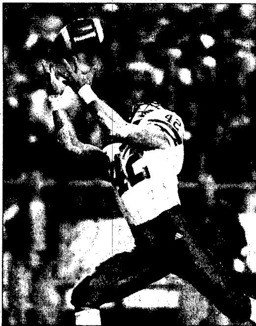
FOUR IN A ROW: Nebraska safety Troy Watchorn picks off a pass Saturday — his fourth interception in NU's last four games.