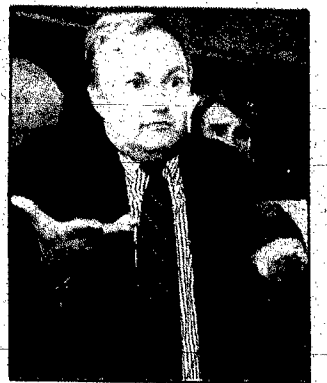
THE ASSOCIATED PRESS DONALD FEHR: The union head said the new taxation proposal doesn't change the basic structure of free agency and salary arbitration. adopted last January. Instead of a salary cap, however, it includes a taxation concept in which clubs could have any payroll they wanted but would be forced to share a larger amount of locally generated revenue as their payrolls increased.

New York (AP) — With the World Series just a day away from being wiped out, striking baseball players delivered a "taxation" plan to owners Thursday and hoped it would be accepted in place of a salary cap. Owners said they will study the plan and respond today, the deadline for canceling the rest of the season. The plan calls for a 2 percent payroll tax and for clubs to split 25 percent of gate receipts, according to people close to the talks, speaking on the condition that they not be identified. Under the proposal, 16 clubs would contribute revenue to the other 12. The union suggested that clubs be required to maintain minimum payroll levels and that teams be prohibited from receiving money for more than three consecutive years. Union head Donald Fehr said players wouldn't agree to any large tax that might be "inhibiting" in the free agent market. If there is a deal today, players probably would return to the field on Sept. 16 or Sept. 19, depending on how many days of workouts the sides agree to. The proposal, according to the union, is based on a framework similar to the revenue-sharing agreement owners